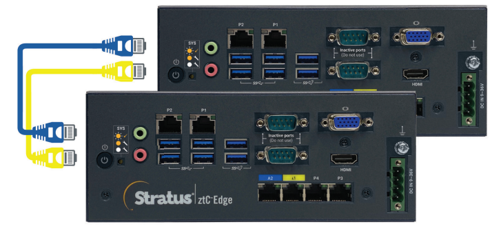
ztC Edge 200i

Field serviceability : When deployed as a redundant pair, ztC Edge platforms are hot-swappable and auto-synchronizing, making field repairs quick and easy. Maintenance or repairs on individual computers can be done to a running system (without a system reboot) to help ensure service continuity. This allows system repair to be planned and completed when its convenient for OT or IT staff.